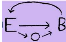
Figure 2. The concept of environmental and behavioral cycle of Wohwill [3].

On the other hand, Wohwill [2] was more straightforward in stating that some of the older ways need to be evaluated with sincere and have moved on to the real issue. Wohwill advised using the model, which is shown in Figure 2.