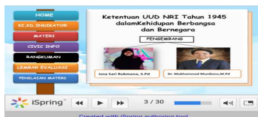
Figure. 2 Civic E-learning Media

Figure. 1 has been explained, that the Gejog lesung android based civic e-learning as a whole has n-gain for students' critical thinking skills on the topic of Undang-Undang Dasar 1945 of 35 Students in a high category. Here is an overview of the android Gejog Lesung based on civic e-learning.