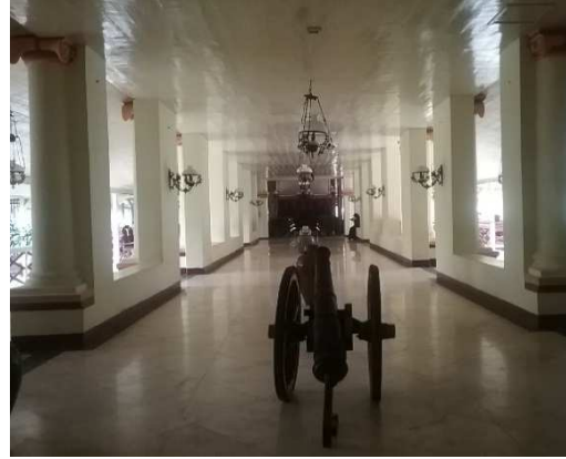
Fig. 4 Madiyoso area