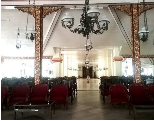
Fig. 3 Pendopo room