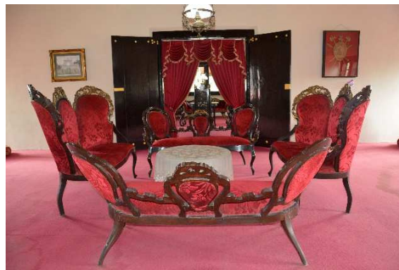
Fig. 5 Furniture on the second floor of the palace