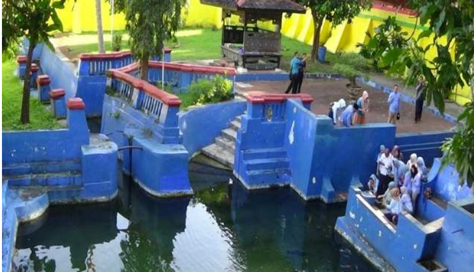
Fig. 1 Bird eye view of Taman Sare

life partner. The second ladder is believed to increase a career. The last is to increase faith and devotion.