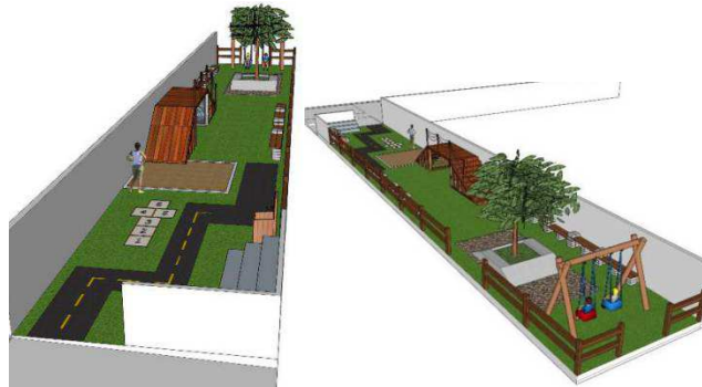
Figure 5. Aerial Perspective of Garden Design in Rancamanyar Settlement