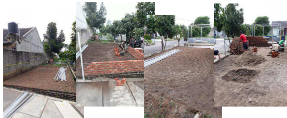
Figure 6. land maturation and constructiin

Following is the construction process for the construction of the Amphitheater Area: