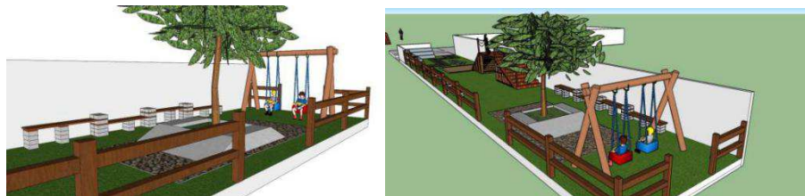
Figure4.Design the park with play equipment and other supporting facilities

At the other end, the open space is equipped with a swing game, with vegetation and a sitting area for parents who accompany their children. Overall, the garden design is designed with the use of various materials that can also be used to educate children more familiar with their environment.