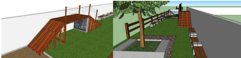
Figure3. Design the park with play equipment and other supporting facilities

In addition to these areas, there are compact game tools that not only function as entertainment games, but are also equipped with educational facilities. These behavior patterns are important; their accumulation and systematization will gradually bring with them belief in the permanence of the external world. But they are not in themselves alone enough to constitute object concept. They imply simply that the child considers as permanent everything which is useful to his action in a particular situation under consideration [2]