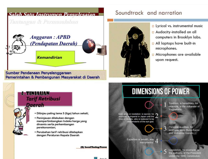
Fig. 1. Implementation of visual elements that are not optimal in online learning lecture notes. The application of design elements such as text, shapes, images, and colors has not been effectively supported by design principles such as composition, contrast, harmony, flow, and alignment. Many graphic elements have only as decorative function.

This research focused on online learning material, especially on lecture note content. Generally lecture notes consist of presentation slides and other digital documents. The observation found that the creation of existing lecture notes still did not optimize design aspects in constructing knowledge for students. The management of text and graphic elements makes the design aspect has an important role in developing lecture note materials. Many lecture note contents do not use the basic principles of good design in its application. The application of design elements such as text, shapes, images, and colors has not been effectively supported by design principles such as composition, contrast, harmony, flow, and alignment. The information conveyed in the lecture note requires reading easiness of information and clarity of student knowledge construction. The use of graphic elements have not been optimally applied to create a good knowledge construction, many graphic elements have only as decorative function. The development of graphic elements can be improved on a higher stage of knowledge construction. This situation can be seen in Figure 1.