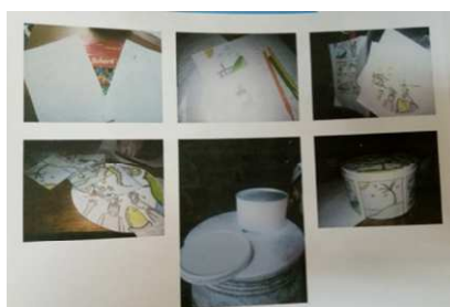
figure 3 : Work process of the fairy tale containers

By applying techniques to draw in Space Time Plane (RWD) or without perspective, many found in a child's drawing about many stories of various Nusantara tales displayed at the sides of the container. To express fairy stories using Wimba way comes with two kinds of approaches which are the inside expression and external expression. The uniqueness of the internal expression's way is where every story is expressed and drawn in only one space which is the top of the can. Meanwhile, the sides of the can are expressed by drawing the story in order on the sides of then container frame by frame, almost like a comic. Other than showing how unique the media to tell the tale, this fable can also have a story synopsis paper inside of the can for every choice of fable that is available. This is for making parents or teachers easy to tell the story to the children.