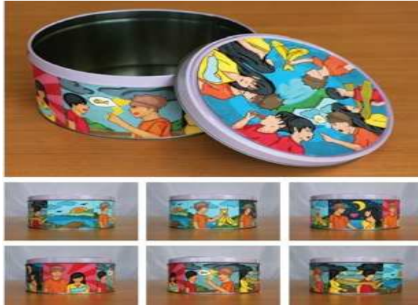
figure 4 : Fairy Tale Can with Danau Toba story from North Sumatera

The Wimba way (a way to draw an object) can be seen on the top of the lid drawn with the internal expression which illustrating the whole story in one frame, we also use child drawing approach with a technique called the flat technique where all objects are seen in the position from above in flat. Including characters and scenes that illustrate movement. Moving objects are shown by multiplying like on Picture 4 on the top of the lid. It is shown that the main character Toba is holding two fishes, however, the idea is that the fish is flopping left and right. As well as the child as a character called Samosir, it looks like there are two-person on the frame but its the way to show that the character moves. Meanwhile, the sides of the container are drawn frame-by-frame like a comic.