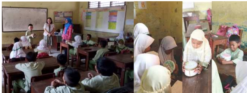
figure 5: Fairy Tale Can trial in SDN SawahBaru 01 Ciputat, Tangerang Selatan figure 6: Enthusiast and respond from elementary students about the fairy tale can

The Wimba way (a way to draw an object) can be seen on the top of the lid drawn with the internal expression which illustrating the whole story in one frame, we also use child drawing approach with a technique called the flat technique where all objects are seen in the position from above in flat. Including characters and scenes that illustrate movement. Moving objects are shown by multiplying like on Picture 4 on the top of the lid. It is shown that the main character Toba is holding two fishes, however, the idea is that the fish is flopping left and right. As well as the child as a character called Samosir, it looks like there are two-person on the frame but its the way to show that the character moves. Meanwhile, the sides of the container are drawn frame-by-frame like a comic.