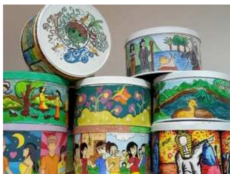
Figure 2 : Results of applying visual language on tin containers as a storytelling media

By applying techniques to draw in Space Time Plane (RWD) or without perspective, many found in a child's drawing about many stories of various Nusantara tales displayed at the sides of the container. To express fairy stories using Wimba way comes with two kinds of approaches which are the inside expression and external expression. The uniqueness of the internal expression's way is where every story is expressed and drawn in only one space which is the top of the can. Meanwhile, the sides of the can are expressed by drawing the story in order on the sides of then container frame by frame, almost like a comic. Other than showing how unique the media to tell the tale, this fable can also have a story synopsis paper inside of the can for every choice of fable that is available. This is for making parents or teachers easy to tell the story to the children.