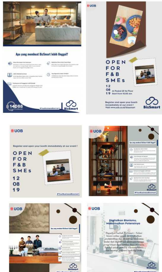
Figure 1 Result of the design

Media strategy is how existing messages and visuals can be conveyed to the audience. Media cannot be arbitrary, of course it must be precise, effective and also based on activities that do not directly interfere with the target audience.