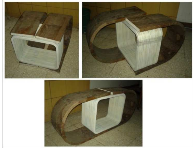
Picture6 Seating facility made of comboard (custom)

The resulting product was successfully made as expected. Pattern of changes in form and function are balanced with a good connection system and able to accommodate needs and functions to be supported. Also ability of a comboard that is able to withstand burden and movement there [10][11].