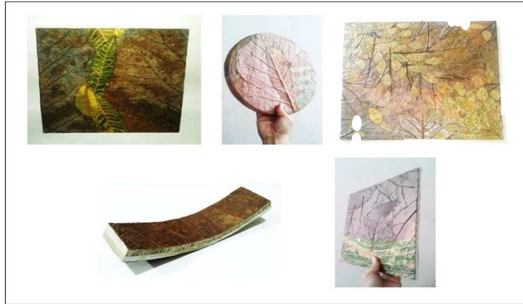
Picture 4 Type of comboards

From steps above, it produced a panel called a comboard. Some physical appearance of comboard can be seen as follows: