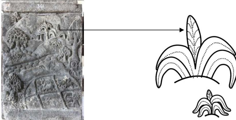
Figure 5. Reliefs of Menak Jinggo Temple (left) and Visual Exploration Results (right)

The processed element is in the form of flora, which is identified as pandanus plants. The visual plant is given isen-isen of cecek that is adjusted to the plant field. Isen-isen of cecek gives a more 'live' nuance to the visual motif.