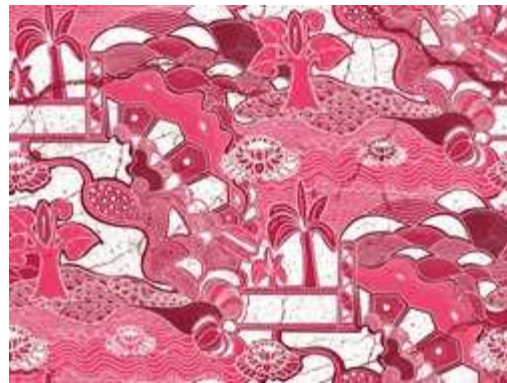
Figures 7 and 8. Majapahit Batik Design results from the visual exploration of the reliefs of Menak Jinggo Temple.