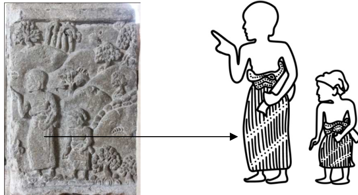
Figure 4. Reliefs of Menak Jinggo Temple (left) and Visual Exploration Results (right)