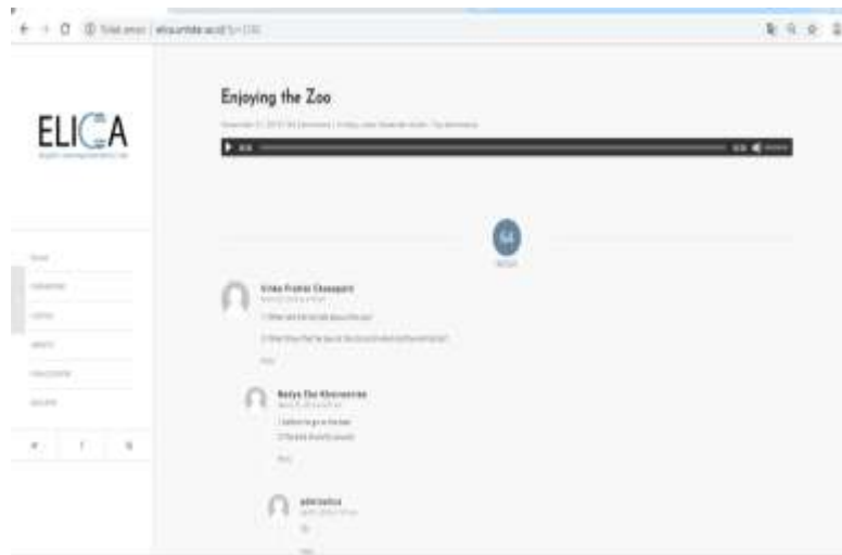
Figure 2. Students' Response in ELICA website