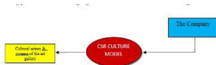
Fig.3. model of CSR funds flow through the coached studios

The third alternative CSR fund flow model is to provide coaching to art galleries. This model will be more perceived by the art gallery. As well as channelling CSR funds for small business development, this model also has the goal of growing and developing existing studios in order to continue preserving indigenous cultures through existing art galleries. Galleries-studio is always trying to introduce the arts to elementary school age children so this art is not extinct. Besides that form of introduction is through training activities and staging regularly at galleries. However, many limitations become galleries owners complain order to be able to continue doing this art performance and activities. One of limitation is in funding problems. The following Figure 3 is a model of CSR funds flow through the coached studios.