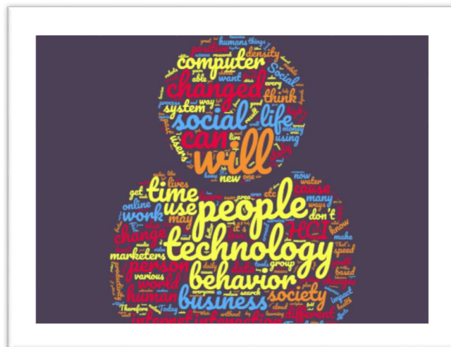
Figure 2. Words cloud of the content of the information about human and technology

Social changes are rising, as also the HCI is more and more significant engaged to the society. Trends of global society change in HCI, it makes the distribution of information fast in all directions and has a promptly response system. For this reason, the impact on economic, political, and social changes the result of advances in HCI, also has caused so many major changes in trends.