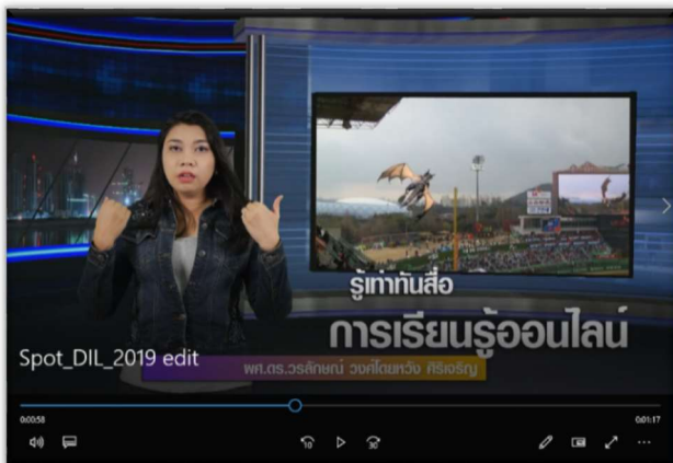
Figure 3. SMART MOOC, DIL literacy Module 3

Technology always has been used in working conditions in all locations and all the time. When communication is progressive and widespread, Interaction over the network makes interaction possible. A video conferencing system on the network system, is the trading system on the network. The nature of these operations allows users to expand the possibility of activities everywhere 24 hours. It spreads closer to the client and with advanced discipline, Service will spread even more at home. In the future, social work will spread until some jobs may sit at home or anywhere and at any time.