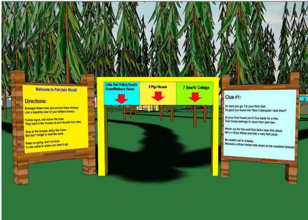
Figure 3: Billboards providing clues and directions in fantasy world

In order to explore the educational and recreational potential of this system, the fantasy world also included a number of billboards which provided clues and directions when users got close enough to read them (Figure 3). Some clues provided details on the destination of each path; others required that