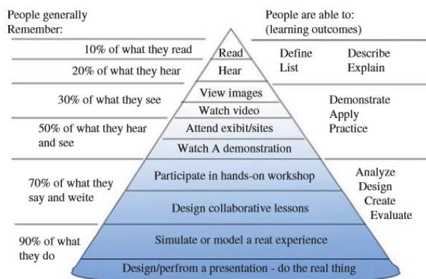
Figure 3. Cone of Experience

"demonstration" by 30% and "practice doing" by 75% which has been applied to paper puppet media and board games (Davis et al, 2014).