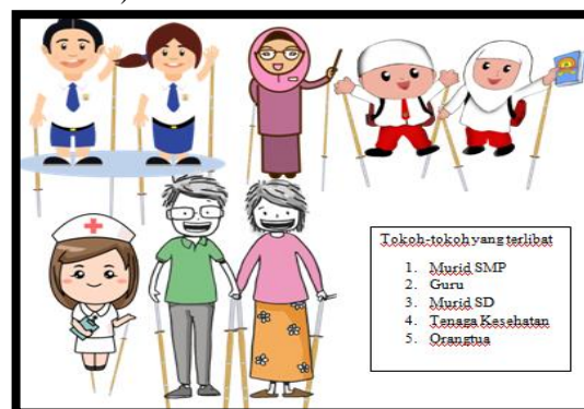
Figure 1. Paper Puppets

Wayang is made as attractive as possible, and presents \pm 10 characters in it according to their respective roles. The character played an appropriate role as an illustration of reproductive health education, such as how to dress, the game played, how to take care of themselves, the right attitude with the opposite sex, and how to reduce anxiety in these children during puberty the first time, both in men and woman. The voice filler is carried out by the team by means of dubbing so that a clear and clear sound can be produced as well as a number of supporting sound effects. In this paper puppet show, the team presented JBI (Sign Language Interpreters), this meant that all performances could be enjoyed by all children with special needs in Padang YPPLB, including even deaf children. This media utilizes audio-visual functions and demonstrations so that the material provided can be easily captured by children with special needs (Yasasusastra, Syahban. 2011).