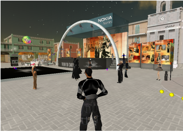
Figure 1: A snapshot of social activities within the Second Life world: a group of avatars is waiting for a concert.

action in online virtual worlds occurs through text messaging, audio and visual modalities. The tactile interaction has not yet been explored. The purpose of this paper is to investigate potential applications of haptic feedback in virtual worlds.