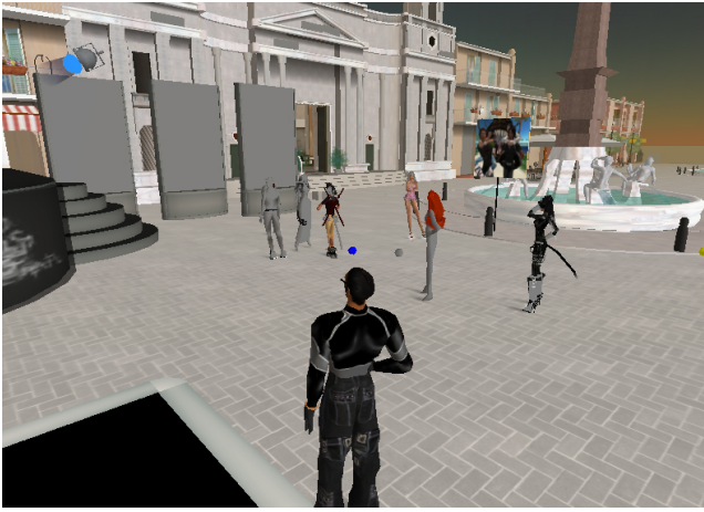
Figure 3: A snapshot from the Second Life Client portraying the well known Parioli quarter in the Second Life world. Some objects and avatars appear grayed since their textures are still being downloaded.

a dead zone (i.e. in which device position is ignored) allows to avoid unwanted movements. Both these parameters are configurable.