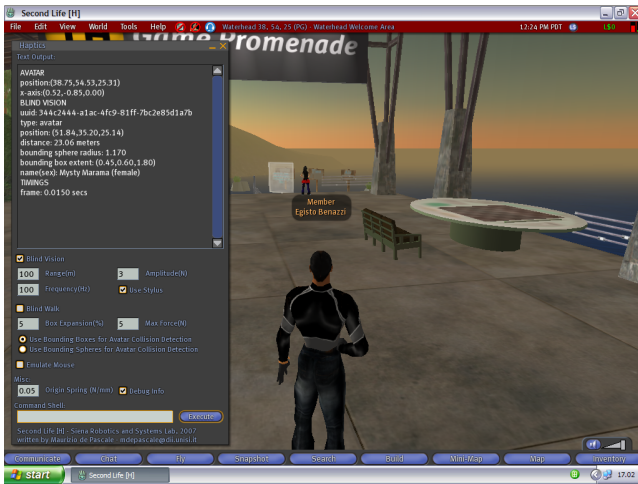
Figure 2: A screenshot from our modified Second Life client. The user is currently perceiving through Blind Vision the avatar in the back of the environment.

vices to navigate in virtual worlds. Studies about walking in digital environments are available, as in [22], where the virtual scene interactively rotates about the user, such that the user is made to continuously walk towards the farthest “wall” of the tracker.