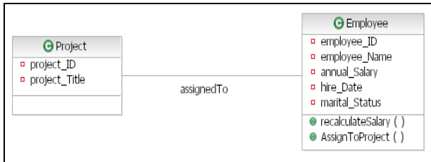
Figure 3: The employee-project modeling exercise

In the student-course modeling exercise, the focus was to increase a bit the complexity of the diagram and measure the values of other stimuli such as relationship elasticity and element's borders. Furthermore, the complexity of the diagram has a bit increased to reflect more realistic class diagrams.