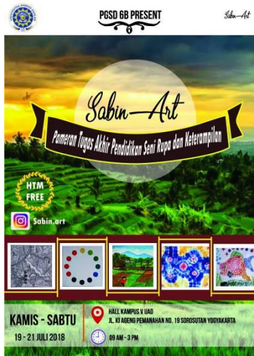
Picture 4. Example of Poster Work Exhibition Advertising