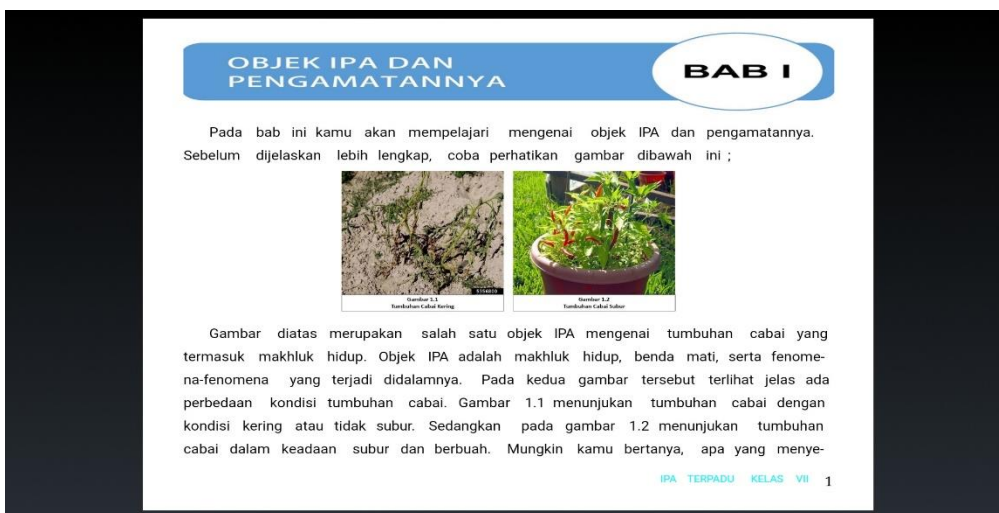
Figure 2. Epub Mobile Version

Pretest is carried out before the use of emulsions (epub) with a blended learning approach aims to measure students' initial abilities. Then posttest was carried out to find out the students' knowledge after applying emulsions (epub) with a blended learning approach. The giving of 30 questions was adjusted to the 5 categories of cognitive questions (Anderson & Krathwhol). Here are the results of the pretest and posttest;