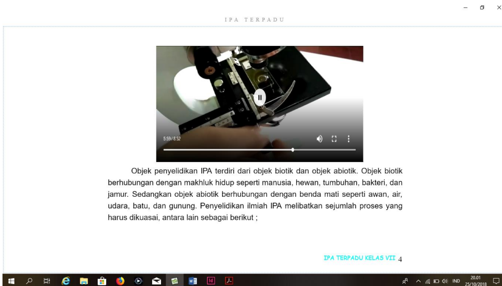
Figure 1. Epub PC Version