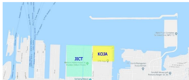
Fig. 2. Layout Tanjung Priok Port

Tanjung Priok port has many container terminals. The terminals are Jakarta International Container Terminal (JICT), KSO Terminal Petikemas Koja (Koja), Terminal Petikemas Indonesia and New Priok Container Terminal (NPCT1). JICT and Koja are located in Tanjung Priok Port and the locations are close from each other. So that the hinterlands of those terminal are same. The location of JICT and Koja can be seen in figure 2.