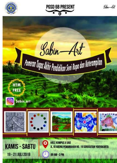
Picture 4. Example of Poster Work Exhibition Advertising