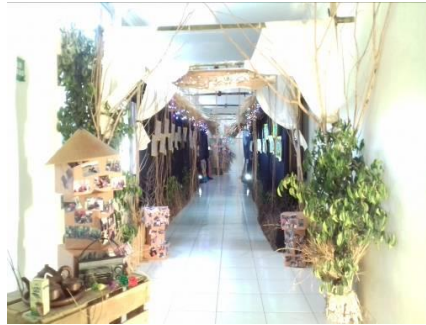
Picture 3. Hallway Building Responding into Exhibition Room