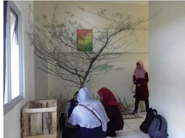
Picture 2. Display Process of Exhibition Work

Students are also asked to be able to make art work or art exhibitions and skills by each class. They compile a work team, make a concept or theme of the exhibition, preparation and implementation of the exhibition. Implementation time for 3 days for each class. In the exhibition, students prepare catalogs, display works, lay out the showrooms, opening events, and supporting activities during the exhibition.