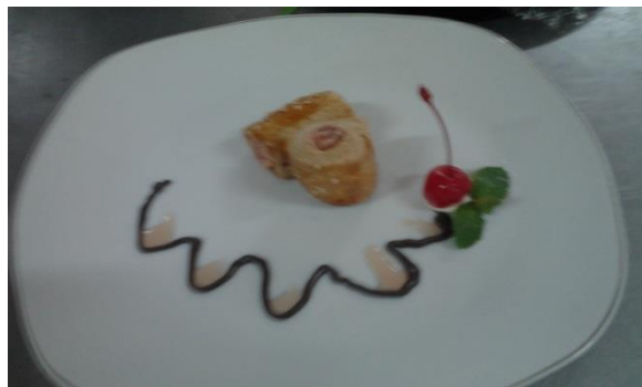
Fig 1. Taro Puff Pastry validation II

The results of the trial on the first validation with a substitution of taro flour comparison of 30:70 (pure taro flour: high protein wheat flour) for the amount of formula has no change but has a text that is still as hard as hard. To anticipate this, the eggs are only replaced with egg yolks, with the hope that the texture of taro puff pastry can be more tender.