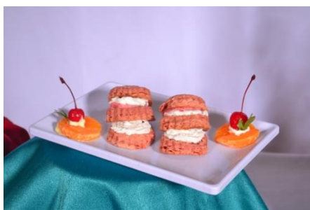
Fig 2. Taro puff pastry in stage II