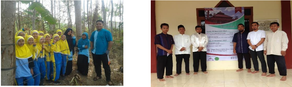
Figure 3: (a) The situation in the morning, (b) The situation on afternoon

Three communities; the football club, the student in Islamic Center and the group of business have been developing the land cooperatively. There is no more spooky after all. They created the mutual participation and togetherness even though people tend to have a priority scale. Choosing what is needed or not. No more spontaneous activity which was happened in five or ten years ago.