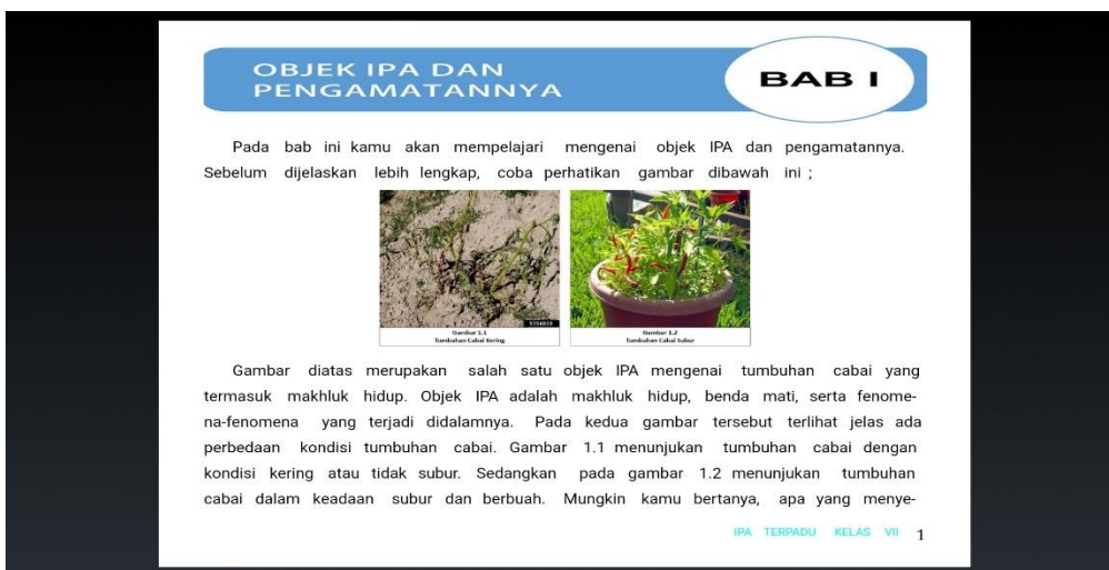
Figure 2. Epub Mobile Version

Pretest is carried out before the use of emulsions (epub) with a blended learning approach aims to measure students' initial abilities. Then posttest was carried out to find out the students' knowledge after applying emulsions (epub) with a blended learning approach. The giving of 30 questions was adjusted to the 5 categories of cognitive questions (Anderson & Krathwhol). Here are the results of the pretest and posttest;