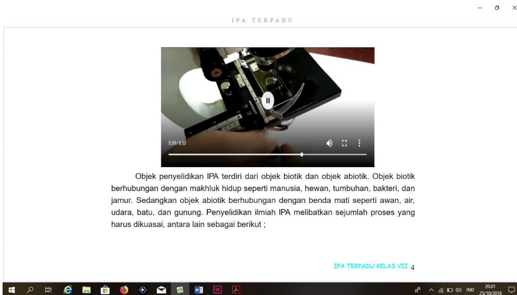
Figure 1. Epub PC Version