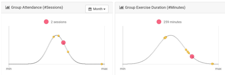
Fig. 2. Patient performance compared to other group members (Color figure online)

In a review of applications to promote physical activity among adults, providing feedback and self-monitoring were the most frequently used techniques [7]. The application provides a feedback on four main statistical measures of user performance. The number of exercise minutes completed, the number of exercises classes completed, the daily step count and the average heart-rate captured during exercises.