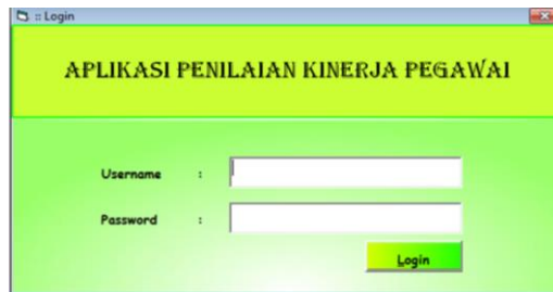
Fig. 2. Login Form of admin and employee assessor

When the performance assessment application icon is activated, it will appear login form and then the user is asked to input the username and password to login into the program. If user and password are input correctly then the system will give the permission. Otherwise, if the user and password are wrong, system will refuse and provide information that the user that is input is wrong. Therefore the existence of login form and other computer security are very important to protect data from irresponsible parties[14].