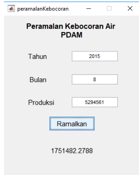
Fig. 2. User Interface PDAM Forecasting