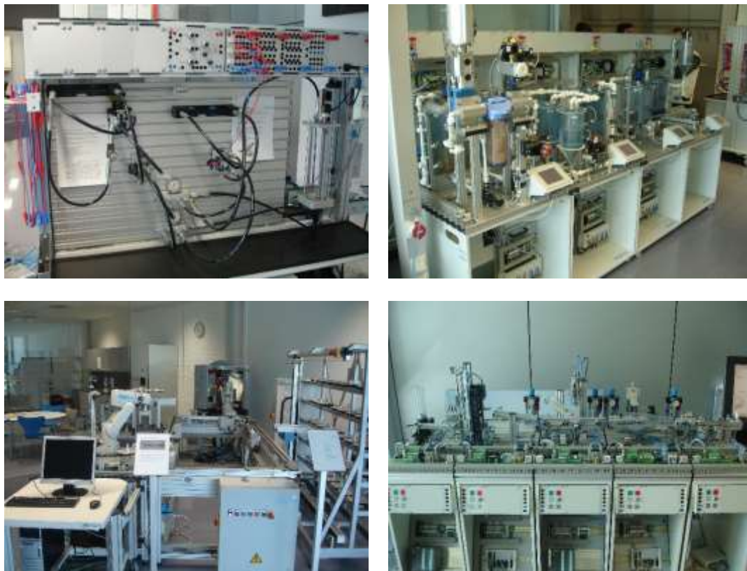
Figure 1. Concern FESTO training stands

An attempt to solve the problem of qualitative training of specialists, based on best traditions of the higher education in combination with modern advanced technologies of teaching, was made by several leading Russian universities, that have specializations in mechatronics, robotics and production processes automation.