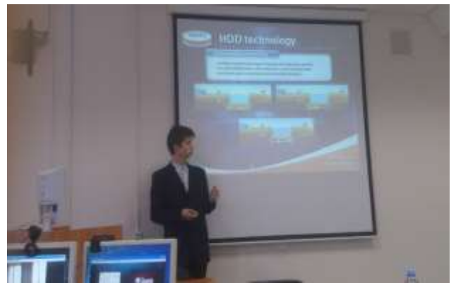
Figure 7. An open defence of the Master thesis at BSTU in 2011

In recent years in regard to a significant increase of a number of graduation theses several best works from each universities are selected. The students are encouraged with certificates and recommendations for entrance to a postgraduate programme, publications in scientific journals and collections of scientific papers of various Russian and international conferences. Several theses have defences in the English and German languages annually.