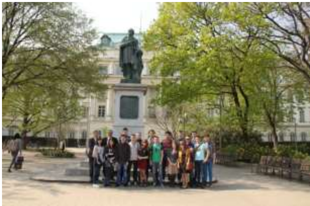
Figure 5. A group of students in Vienna University of Technology within the framework of the international educational practice

The network cooperation of the universities reflected also in a sphere of scientific and technical creativity of the youth. University teams participate in different engineering competitions and Olympiads not only as rivals, but also take part as inter-universities teams. An example of this cooperation can be the victory of the united teams of “VOENMEH” and “MPEI” at first All-Russian festival of robotics in 2009.