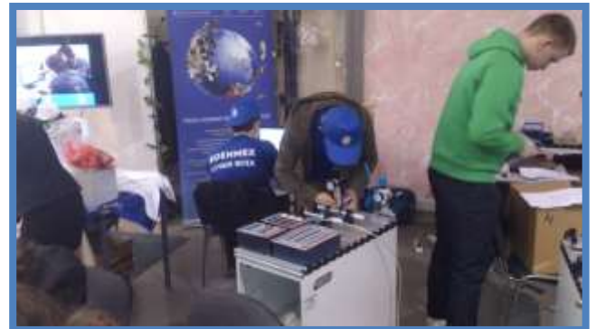
Figure 6. Regional competitions World Skills 2015 in Saint–Petersburg

In 2010 the first open graduation theses defense of “VOENMEH”, “MPEI”, OmSTU and KarSTU was held. This event increased a degree of students responsibility while writing the theses and, consequently, increased the quality of the works.