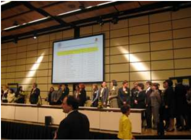
Figure 8. XX Symposium DAAAM International 2009 in Vienna (Austria)