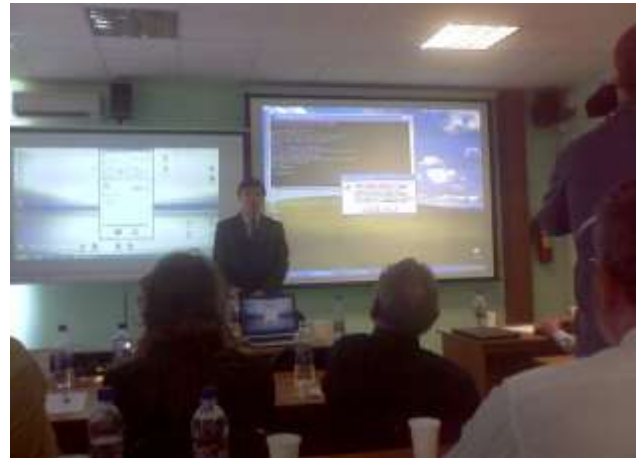
Figure 10. The International youth Internet conference OmSTU “Automation, mechatronics, information technologies”

In the sphere of the highest qualification specialists training within the framework of an interuniversity scientific council pre-defences of theses of academic degree candidates are regularly held.