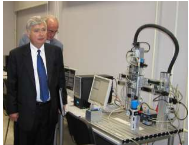
Figure 2. The FESTO concern owner doctor Stoll at the opening of the International scientific and educational center BSTU–FESTO “Synergy”

It became possible due to presence of the FESTO unique training laboratory equipment in the universities by that time and provision the universities with the reliable dedicated channel of a quality Internet connection with the help of FESTO company.