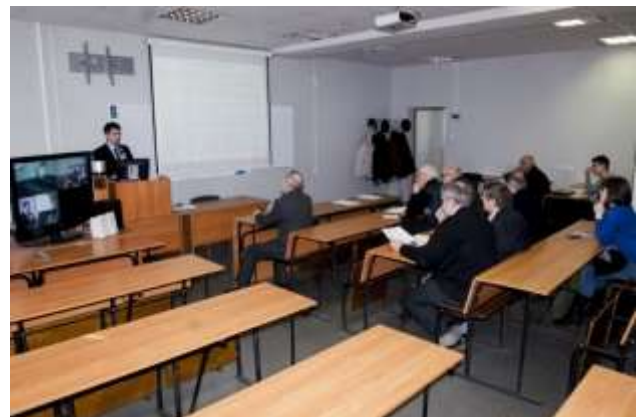
Figure 11. The open preliminary defense of the Candidate of Science thesis at BSTU “VOENMEH” in 2015

It allows to consult the works much deeper and to prepare more resoned reviews. Discussions on such pre-defences helps to attract attention of scientists of different universities to engineering and intellectual potential of each of them, encourages to start cooperation in science. Perennial collaboration of the “Synergy” project universities have a positive impact on a development of bilateral relations between the universities, which number has significantly increased – up to now there are 13 universities, 4 of which are from foreign countries. Products of this collaboration are: two-degree graduation, exchange of students, outside lectures, lecturers and students trainees heap, consultations for academic degree candidates, review and opposition for dissertations.