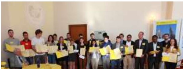
Figure 9. Participants of the International Doctoral School DAAAM International 2015 in Zadar (Croatia)

The conversation takes place in an informal setting and covers a wide range of issues – from narrow-profile to common, performing not only a scientific, but also an educational function.