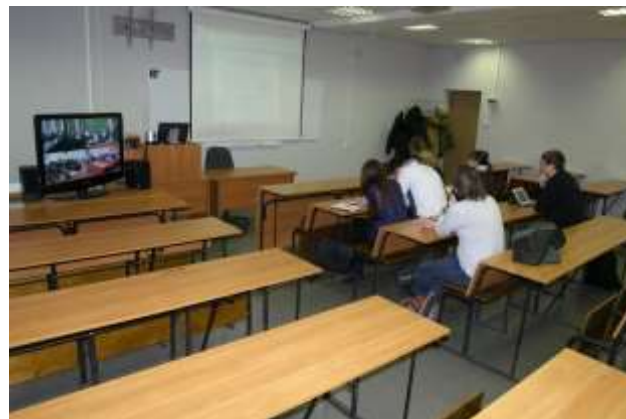
Figure 13. The joint network course “Intellectual control systems”

In the lent-term of 2015-2016 academic year, the course, consisted of 4 modules (each one of them consisted of 3 lectures or 6 academic hours), was lectured by teachers of “MPEI”, KarSTU, OmSTU and Peter the Great St. Petersburg Polytechnic University, that entered the project in 2014. Along with the students of the presented universities the students of first Mater year of “VOENMEH” have attended these lectures.