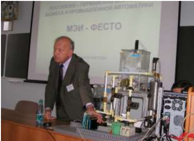
Figure 4. The head of MPEI–FESTO Centre, cosmonaut, Twice Hero of the USSR, Professor Eliseev A.S.