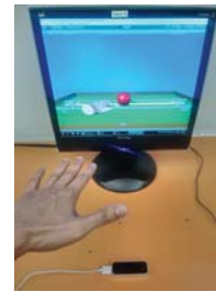
Figure 1. Performing the task of moving a virtual sphere.

In the last decade, free hand interaction systems have reflected a positive increase in their use for various applications. A free hand interaction system and virtual reality together could serve as a great healthcare assisting tool to remotely assess people with Parkinson's disease (PD). PD is characterized by symptoms of bradykinesia associated with tremor, stiffness and postural instability [16]. Tremor is one of the most recognized symptoms of the disease, which is rhythmic and involuntary oscillatory movement in certain parts of the body [18]. The most common type of tremor is rest tremor, and tremor can re-emerge a few seconds after voluntary movement [6]. The study of tremors in patients with PD, have focused on measuring amplitude, frequency components, and quantified data using statistical methods [11]. The use of the above metrics can provide useful medical information to the therapist or physician to provide better insight into the clinical data. The