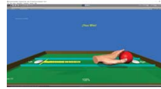
Figure 4. A snapshot of the game interface for Task 2.

Three tasks per patient were performed, during the measurement of postural tremor (Task 1) the patient was instructed to stretch the left arm out in front of the body with palm down. The wrist was straight and the fingers comfortably separated