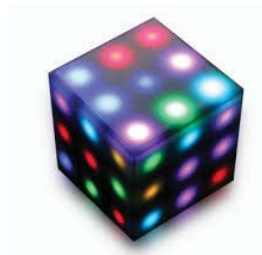
Figure 1: Futurocube

rehabilitation applications where subjects were suffering from severe motor impairments e.g. stroke survivors [8] or cerebral palsy [9]. Many of these studies apply a machine learning approach in which the accelerometer and/or gyroscope signal is used to extract and calculate features from the time and frequency domain that are subsequently used to train and test an algorithm that is able to predict the motor skill performance of impaired subjects.