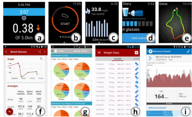
Figure 2.2 Common visualization techniques on smartwatch and smartphone applications. a) Text. b) Donut chart. c) Bar chart. d) Pictograph. e) Map. f) Line chart. g) Pie chart. h) Table. i) Complex visualization (e.g., 2D Area chart).

In an attempt to gain insights on current needs for exploration of health and fitness data, we conducted a series of interviews with people who track and explore their health and fitness data on a regular basis. We were interested to investigate (1) whether people explore or wish to explore their data in-situ, (2) what issues and problems they currently face, (3) the types of questions they like to get answers for, and (4) what design requirements a solution targeting in-situ exploration of health and fitness data entails. We opted for having more than one person in each session to stimulate more dynamic and in-depth discussions among participants about the topics.