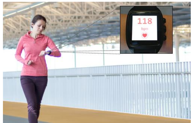
Figure 1. A runner checking heart rate information on her smartwatch to adjust her activity.

The growing number of consumers carrying wearable health and fitness trackers collect significant amounts of data about their activities. A survey of over 3,000 adults (in the US) revealed that 69% of this population track health and fitness related information such as exercise routine, or food consumption [23]. People often explore such data to gain insights on their daily activities and to reflect on ways to improve their health [2, 3, 4, 6, 14]. While users commonly