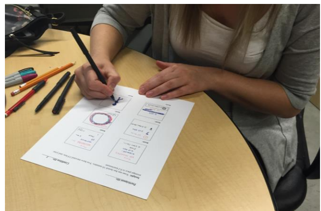
Figure 4. Designer sketching ideas for in-situ exploration of different activity related information.

Our design sessions lasted two hours with a five-minute break halfway in the session. We explained to the participants, the main limitations for in-situ exploration scenarios as: (1) a short exploration time of less than 5 seconds and (2) a small display size (about 1.5 Inch IPS). We continued by showing several examples of data representations from current smartwatch apps. After the introduction, participants were handed colored pens, pencils, and markers as well as design sheets. On the design sheets we included the text for the target insight to be conveyed and placeholders (Figure 4) representing the display size of a typical smartwatch with the addition of some space to account for the lower pen resolution. For each insight, the experimenter started a 10 minute timer and asked participants to generate as many sketches as possible focusing on: (i) conveying the insight to the user of the smartwatch for in-situ exploration; (ii) selecting data representations that fit the data and insight best. Participants were encouraged to talk out loud and had access to extra design sheets. The researcher took notes and at the end, asked participants to describe their designs and rank them based on how well the designs fit the initial requirements.