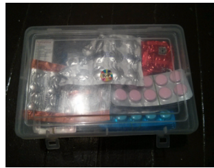
Figure 1: Over-the-counter medicine and prescription medicine that the participants brought from their home countries.

alienation, and financial difficulties [7]. These challenges could increase stress and lead to health issues among international students [6]. Thus they visited health centers more frequently and had a higher admission rate to hospitals than American students [3].