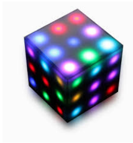
Figure 1: Futurocube

rehabilitation applications where subjects were suffering from severe motor impairments e.g. stroke survivors [8] or cerebral palsy [9]. Many of these studies apply a machine learning approach in which the accelerometer and/or gyroscope signal is used to extract and calculate features from the time and frequency domain that are subsequently used to train and test an algorithm that is able to predict the motor skill performance of impaired subjects.