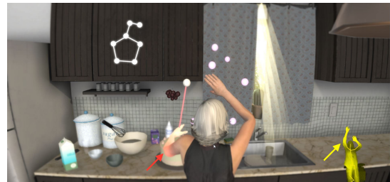
Figure 2. A participant interacts with AS IF through a virtual body (an "avatar"). The red arrow points to the avatar's body part affected by chronic pain (the elbow), while the yellow arrow indicates the player's mirrored gesture in real world.