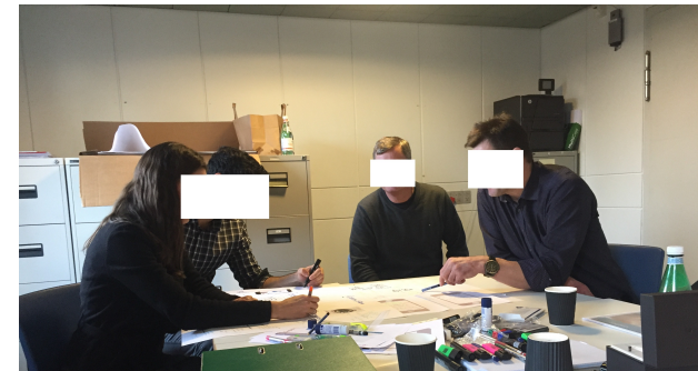
Figure 3: Discussion at a design workshop.

To inform the design of the system, biweekly user-centered design meetings have been conducted over a period of 12 months at the Psychiatric Center Copenhagen, applying the Patient-Clinician Designer (PCD) framework [8]. The process has included patients (2), a psychologist (1), psychiatrists (2), computer scientists (2), and a biomedical engineer (1). An image from one of the workshops is shown in Fig. 3.