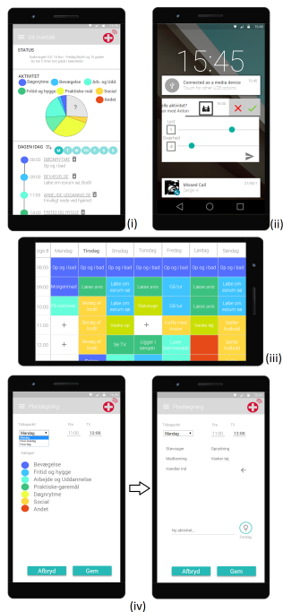
Figure 2: Screenshots of the Moribus prototype.

short-term consultations and problem solving technique. However, in a large 16-week randomized trial [2] it was found that behavioral activation (BA) alone was as effective as pharmacotherapy and both treatments were significant better than cognitive therapy (CT). The treatment plan for BA starts with the patient reporting his/her activity every hour for several weeks [7]. This is done on a print-out of a week schedule typically between 8am and 11pm. The activity is provided with a score on 'mastery' (i.e., the level of accomplishment) and 'enjoyment' (i.e., how pleasant was the activity?). Together with a psychologist the patient then identifies activities that reinforces depressed and healthy behavior [7]. This information is then used to plan activities of the following week.