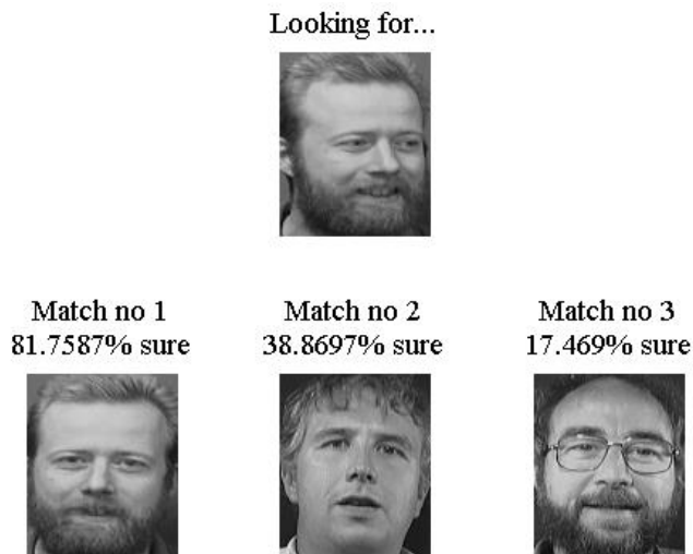
Figure 3. Face recognition example using trainrp as training function

Based on Figure 2 and 3 and the percentage of successful recognition we can say that used algorithm and neural network have shown good results so far. This leaves room for further testing with bigger image database and different training