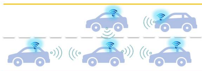
Fig.2. Vehicle-to-Vehicle communication system.

planning group to the president introduced ITS in 1993 [7]. However, ITS infrastructure has to consider road, IT, and V-to-V communication such as shown in fig.2.