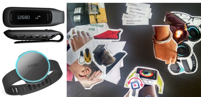
Figure 1. Left: Fitbit One (top) and Moov (bottom) devices used in the lab session. Right: Examples of prompts used for the participatory design activity: form factors (left), measurement targets (top), output (right), and input (bottom). Blank paper was also provided to sketch new ideas.