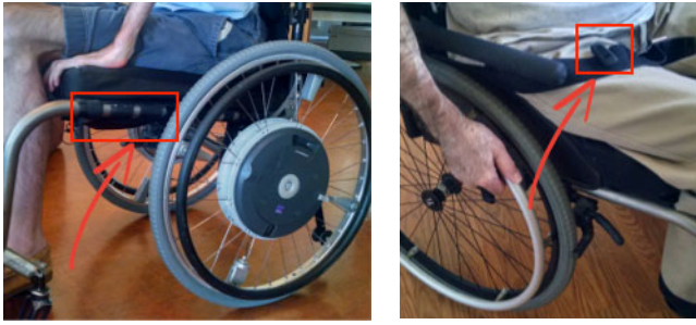
Figure 2. P8 (left) stowed the Fitbit One in a pouch under his seat and P10 (right) clipped it on the seatbelt.

from this angle.” Another concern was how to place the tracker to ensure it would work for non-walking movement. P12, who uses a power wheelchair, described his thought process: