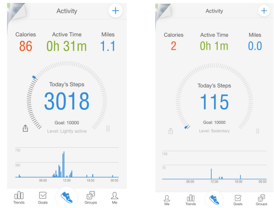
Figure 4: P3’s log showing more activity than expected (left) and P9’s log showing much less activity than expected (right).

Participants also had differing interpretations of the impact of inaccurate tracking. For P9, not only were the steps inaccurate but also the calorie count and number of active minutes, measures she had expected to be more inclusive—after a full day of wheelchair use, the app reported only 1 minute of activity and 2-4 calories burned. But P8 interpreted the data more abstractly: “...it’s not