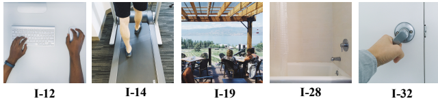
Figure 2: Sample activity images used in YADL (Indexes below)