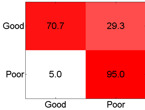
Figure 3: Heatmap confusion matrix showing binary classification results with all five sensors. Rows show the actual class of a repetition and columns show the classifier’s prediction

Figure 4 shows a confusion matrix for multi-class classification when using the 5 sensor set up. ‘Normal’ (N) performance of the squat is detected with a 68% TP rate. 6% of normal lunges were confused by the classifier to be ‘step too short’ (STS) and 7% of normal lunges were mistaken to be ‘step too long’ (STS). The ‘push back’ (PB) deviation is the worst detected deviation with a TP rate of just 46%, almost 10% of PB reps were mistaken to be ‘normal’ (N) by the system. The best detected deviation was ‘stutter step’ (SS) with a TP rate of 81%.