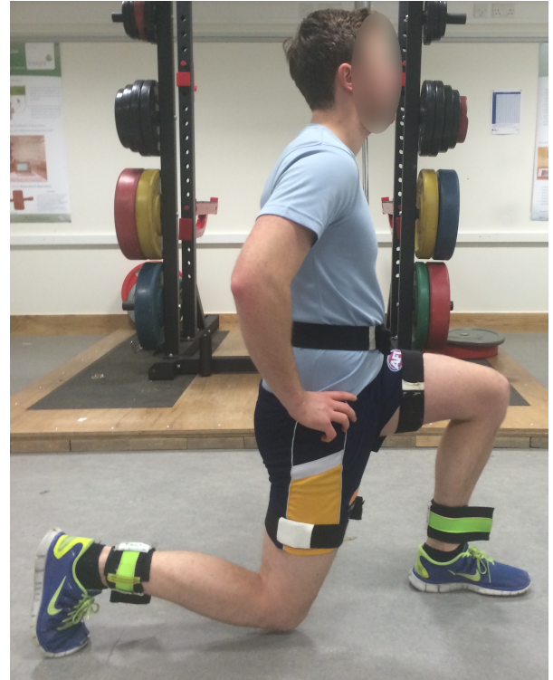
Figure 1: Image showing the lunge exercise and the five sensor positions: (1) The spinous process of the 5th lumbar vertebra, (2&3) the mid-point of both femurs on the lateral surface (determined as half way between the greater trochanter and lateral femoral condyle), (4&5) and on both shanks 2cm above the lateral malleolus

This study was undertaken to determine the minimal IMU sensor set that can discriminate between different levels of lunge performance and identify poor exercise technique. Data were acquired from participants as they completed the lunge with normal technique for 10 repetitions. IMU data were then acquired while three repetitions of the same exercise was completed with eleven commonly observed deviations from correct technique.