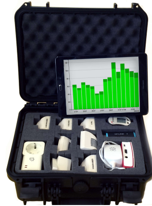
Figure 1: The Hipperbox consisting of a Raspberry Pi, a set of sensors and a tablet.

As a consequence of increasing health care costs, the rehabilitation process after a hip surgery is performed increasingly at home. Professional caregivers (physical and occupational therapists) experience a lack of insight in the effectiveness of the rehabilitation in this new situation. The professionals have no overview of the improvement of the patients during the rehabilitation phase. As part of the research project Hipper, researchers of our university (ICT and Health departments) together with therapists and clients