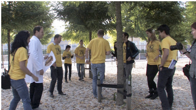
Figure 3. Being Slime Mold Enactment, at BioDesign exhibition, Rotterdam, 2013.

Less conventional participatory activities include Being Slime Mold , a collective participatory experiment originally designed as a means of extending public engagement with exhibits at the BioDesign exhibition in Rotterdam in 2013, through observation, simulation and enactment of the slime mold (Fig. 3). Since then the experiment has been adapted to a range of contexts including a Financial Times conference (modeling synchronous organizational systems) [8], Open Embodiments Conference (embodying biological behaviors) and a conference on complexity in a digital age (as a form of biomimicry in action) [9].