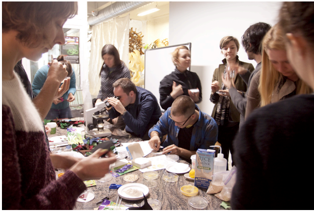
Figure 2. Open adult Physarum workshop at GenSpace community laboratory, New York, 2011.

Less conventional participatory activities include Being Slime Mold , a collective participatory experiment originally designed as a means of extending public engagement with exhibits at the BioDesign exhibition in Rotterdam in 2013, through observation, simulation and enactment of the slime mold (Fig. 3). Since then the experiment has been adapted to a range of contexts including a Financial Times conference (modeling synchronous organizational systems) [8], Open Embodiments Conference (embodying biological behaviors) and a conference on complexity in a digital age (as a form of biomimicry in action) [9].