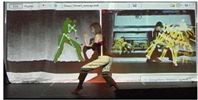
Figure 4. Choreographer Working with Kinect and Integrate Systems

We performed a pilot study to explore what kinds of features could support collaboration in an intelligent autonomous choreographic system. To test our process we devised a critical inquiry by developing a choreography in the studio with the aid of a Wizard of Oz exploration of the interaction between a simulated software tool and a choreographer. Critical inquiry comes from Human Computer Interaction and uses ethnographic methods to collect data in the field, or in situ [18]. Data