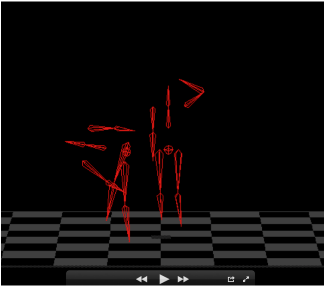
Figure 6. Choreographer Working with Kinect, Integrate and DanceForms Systems

was also a narrow spectrum of capture opportunities for a dancer. The available floor space for capture is small (oriented towards gamers fixated on a screen), the camera still needs to see recognizable limbs even with the depth camera (limbs are easily lost and replaced as standing still), sudden changes of movement or tempo are often lost. Many movements were not able to be captured including curved spine, swinging limbs, legs extended above 90 degrees and any sense of weightedness in the movement. This lack of specificity in the movement data constrained the opportunities for manipulating choreographic process computationally. The choreographer made choices towards basic, more easily recognized movements, attempted to move more slowly, not perform work on the ground which had the effect of reducing complexity and novelty. The most prominent creative understanding in the process with the Kinect was that it brings a strong focus to the body's positions, rather than orientation, spatial relationships and quality or expressivity of movement. There are many qualities that lend themselves towards defamiliarization practices, augmenting the original movement in unique positions and jittery interpolations.