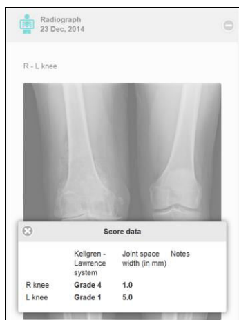
Figure 3. Radiograph presentation and its scoring metrics

Furthermore, the clinician can upload educational material (links or files) that may be helpful for patients for better understanding of the nature of the condition, or for further learning about the recent advances in the osteoarthritis research. Finally, the clinician can send a message to the patient or respond to his questions.