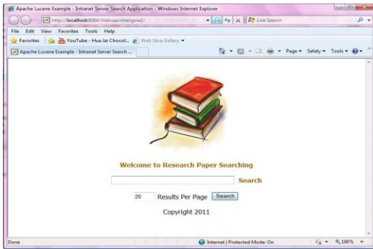
Figure 2. Research Paper Searching web page.

In the experiments, an indexer was developed. Equation (4) shows a modified Term Frequency/Inverse Document Frequency (TF/IDF) formula for the indexer. Here, TTA corresponds to tag, title with abstract [2]. Fig. 2 shows an example of the interface web page developed in the experiment. Here, the subject can specify their search criteria and investigate the results from each search engine. The number of the results per page can also be defined. In addition, the subject can view the results by title, abstract and the full text.