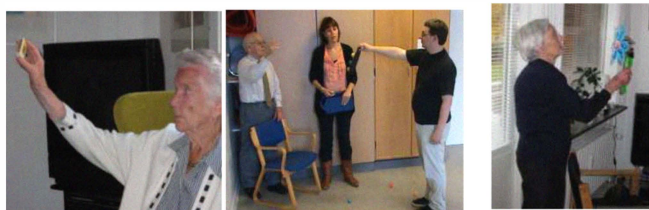
Figure 2: (left) Home exercises without technology. (Middle) PD dart activity at the clinic. (Right) PD flower activity in the home.

on prototypes during the regular training with the participation of both physiotherapists and the patients.