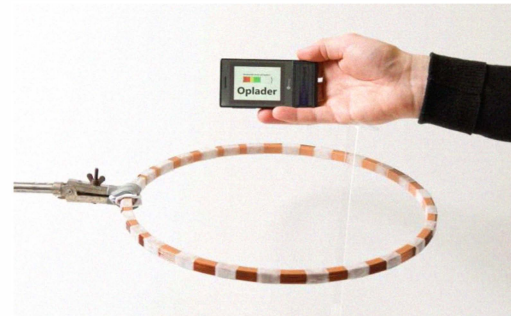
Figure 4. An image of the recharging OCPCD in a distance of 30 cm. from the source coil.

We will demonstrate that the OCPCD can be charged using wireless power, and the general use of the worn device. We will also discuss alternative usages, including charging other healthcare devices.