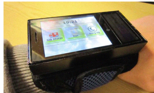
Figure 1. The OCPCD device showing a part of the user interface, including the alert button, the "open door" button, and the phone button.

The system is designed as a mobile device to be worn around the wrist (or potentially around the neck). It simplifies everyday life for the user by making basic tasks easier to accomplish and handles potential sensor communication.