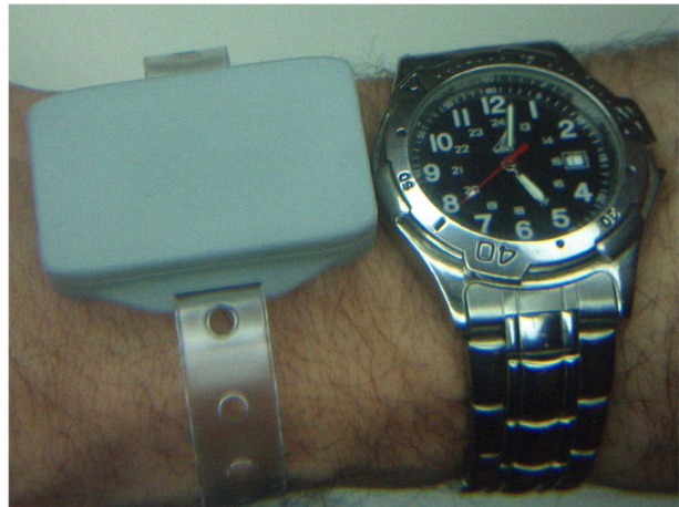
Figure 1. Magtag, side-by-side with a wrist clock.

Since the localization device was designed to be worn on the subject wrist, the module should not largely exceed the dimensions of a wrist clock. Fig. 1 shows the developed module.