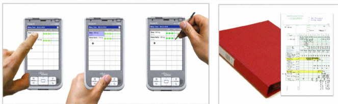
Figure 1. The three candidate interaction techniques finger, buttons, stylus and the paper chart.

For this experiment we utilized a usability laboratory where we recreated the hospital environment and evaluated the interaction techniques in a “hospital ward simulator” with