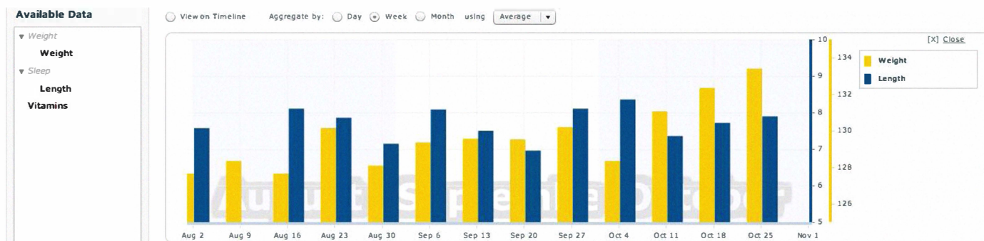
Figure 4. A portion of the Salud! application's analytics interface. Two columns from different Logbooks are shown on the same graph. Graph values are weekly averages of the two columns.

goal management system into the Salud! infrastructure. The API for this system will allow interested researchers and developers to easily integrate goal management functionality into their applications. We are looking to literature on behavior change and self-efficacy to understand effective strategies for goal setting and achievement, and expect to integrate these into the goal management system. As such, the functionality made available through the goal management API will encapsulate effective strategies and best practices for goal management. We are currently focusing on two specific health self-management goal management strategies: actionable vs. inactionable goals, and experiences of personal mastery.