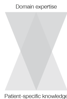
Figure 1. Team members were distributed along a spectrum of knowledge, creating reciprocal interdependence.

Some team members, such as therapists, fell somewhere in the center of the spectrum. For example, speech therapists had expertise in speech-language pathology and applied it to their work with the same child once or twice a week. Although they had some regular contact with the child, outside of these one-on-one therapy sessions, speech therapists depended on other staff members for information about the child's regular progress.